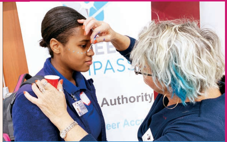
Central Louisiana students enjoy the interactive exhibits at the 2018 Students Exploring Career Opportunities event.