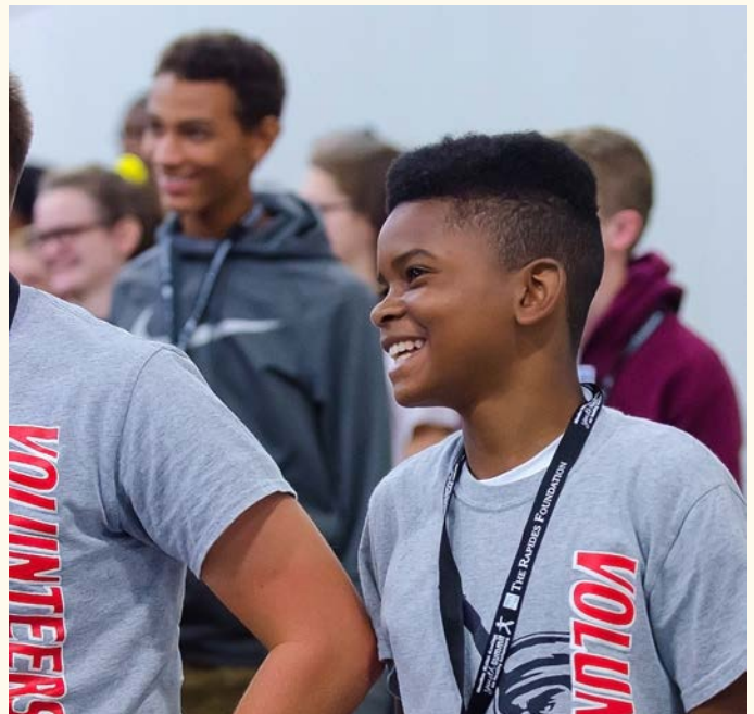
Students participated in energizer activities during the annual summit.