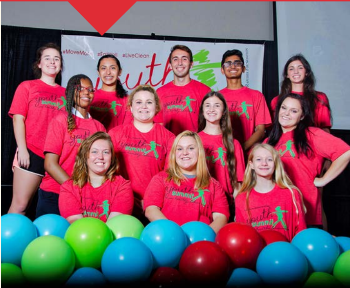
Youth Advocacy Council members worked throughout the year to plan the summit and develop an advocacy project.

The theme of the Youth Summit on Healthy Behaviors was #MoveMore #EatWell #LiveClean . It was planned by a group of youth advocates from throughout Cenla who serve on the Foundation's Youth Advocacy Council.