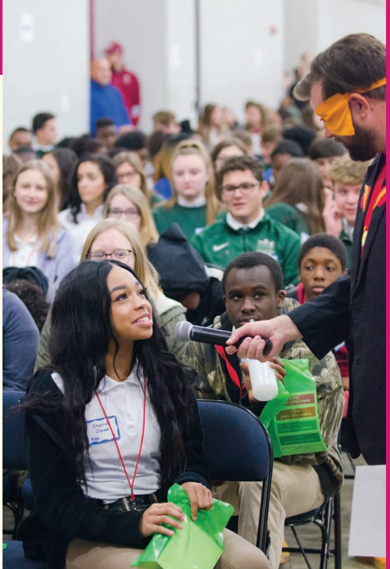
The Cenla Jobinator questions students about their career choices at the 2018 SECO event.